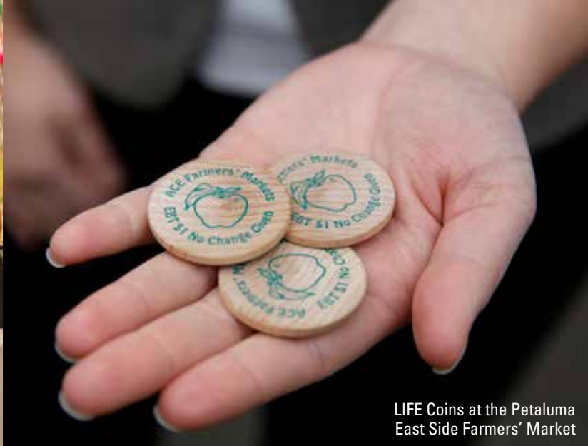
LIFE Coins at the Petaluma East Side Farmers' Market