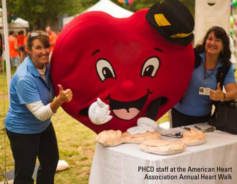
PHCD staff at the American Heart Association Annual Heart Walk