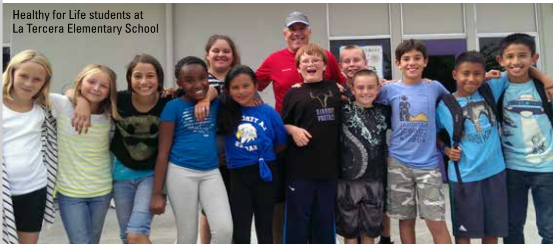
Healthy for Life students at La Tercera Elementary School