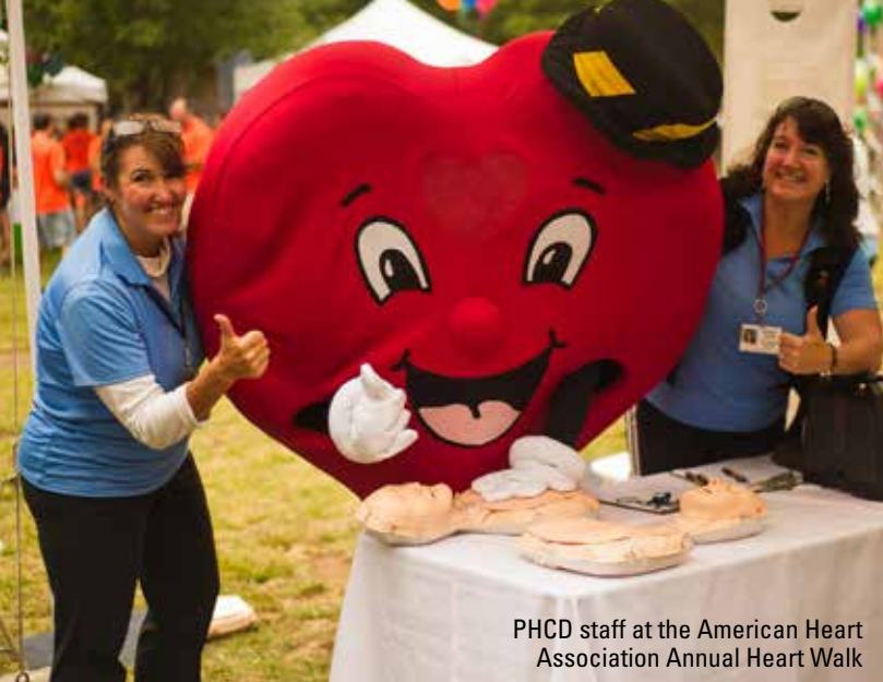
PHCD staff at the American Heart Association Annual Heart Walk