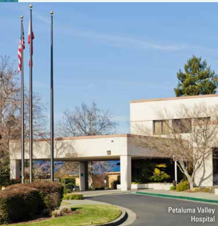
Petaluma Valley Hospital

Healthquest staff also drive our HeartSafe Community Initiative, providing key support and expertise in Petaluma's recent HeartSafe Community designation.