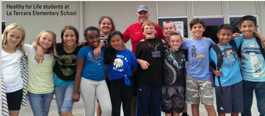
Healthy for Life students at La Tercera Elementary School